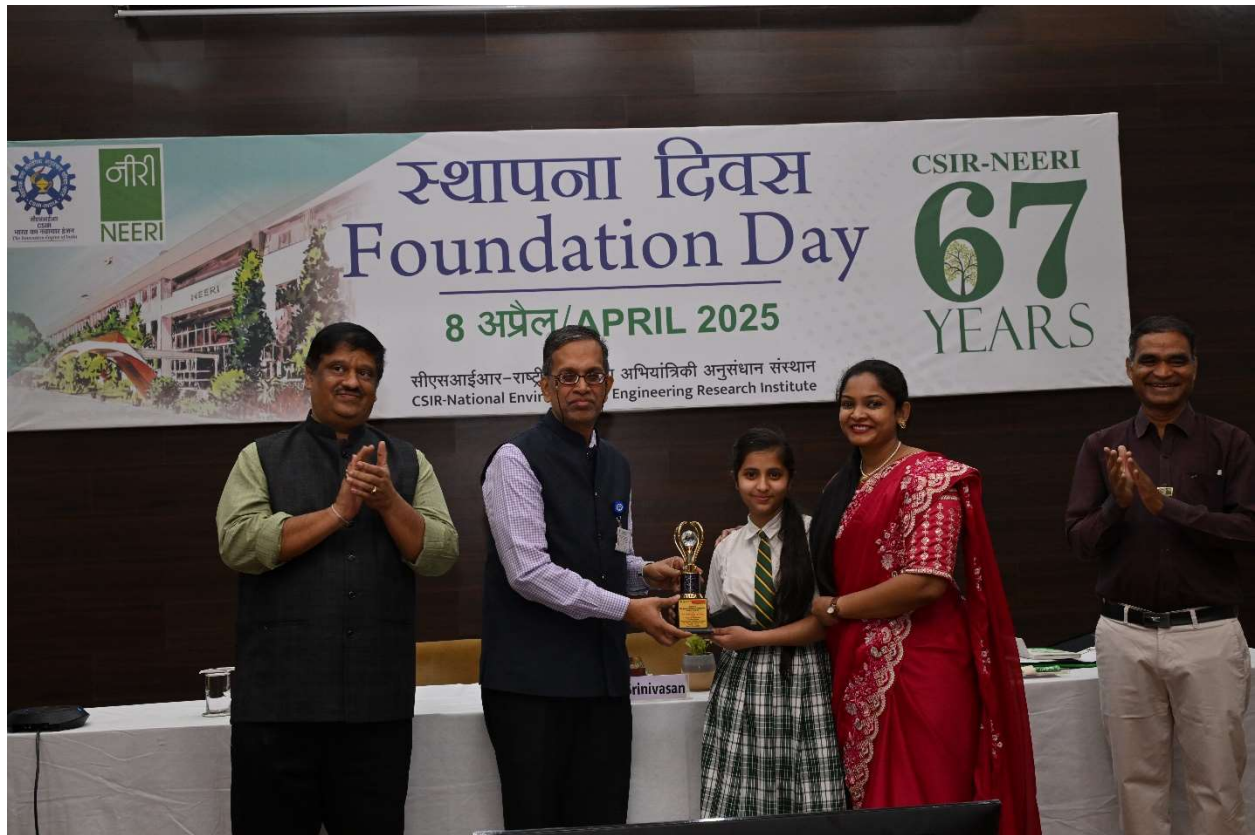
The student receiving the foundation day award as a winner of the Science Models Competition