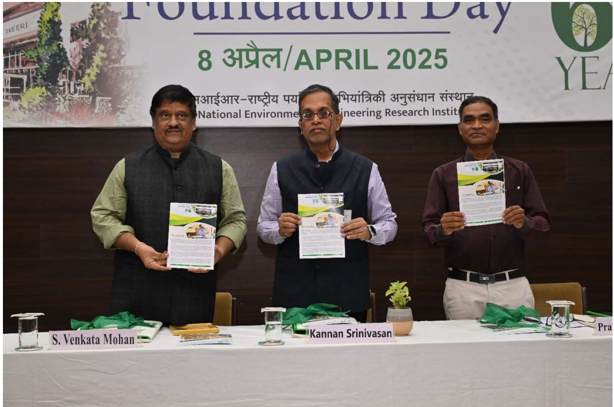
Dignitaries releasing the CSIR-NEERI Newsletter and Brochure