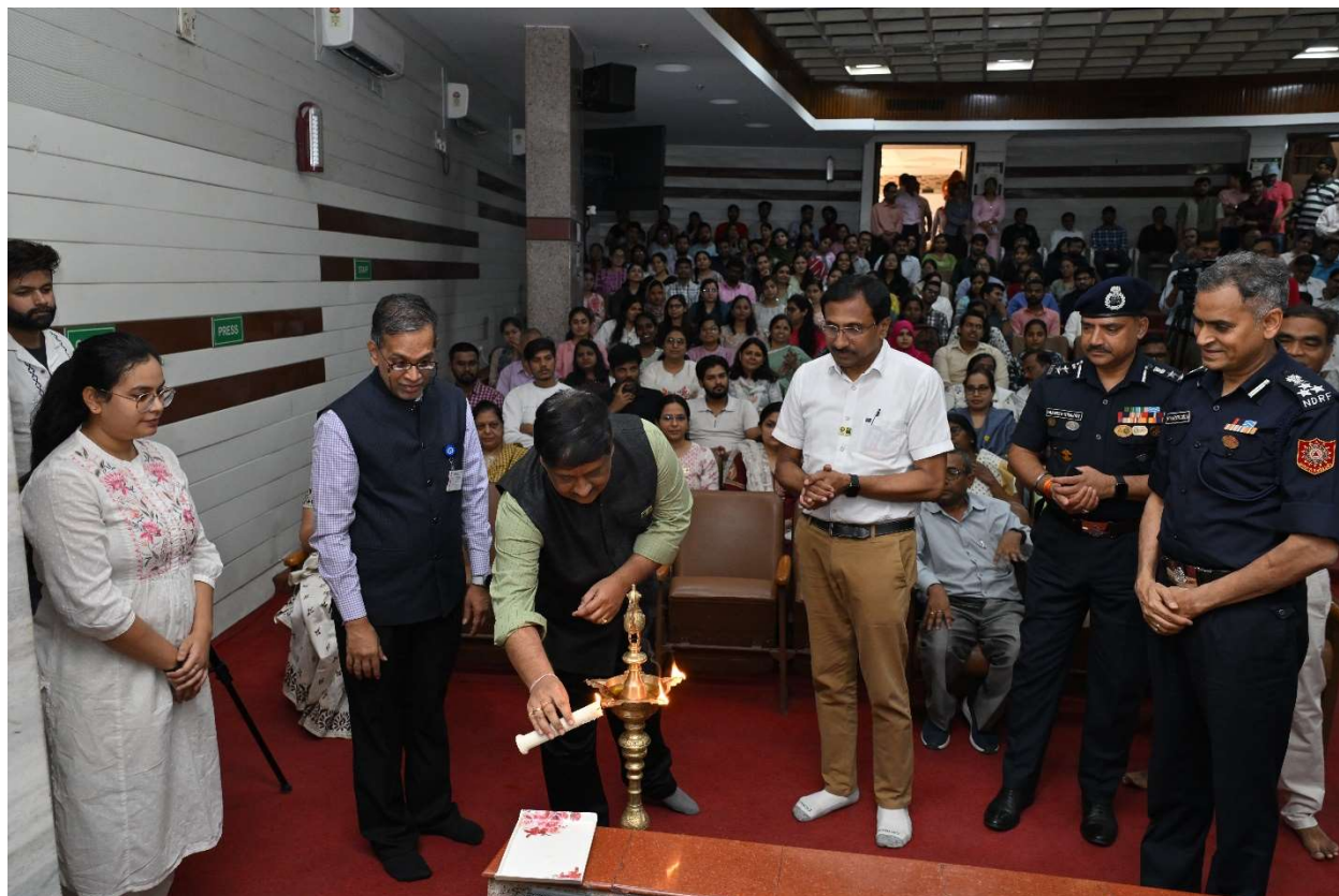
Dignitaries lighting the lamp

A voluntary blood donation camp was organized by the CSIR-NEERI Staff Club in association with the GSK Blood Centre, Nagpur, at CSIR-NEERI as part of the CSIR-NEERI Foundation Day celebrations.