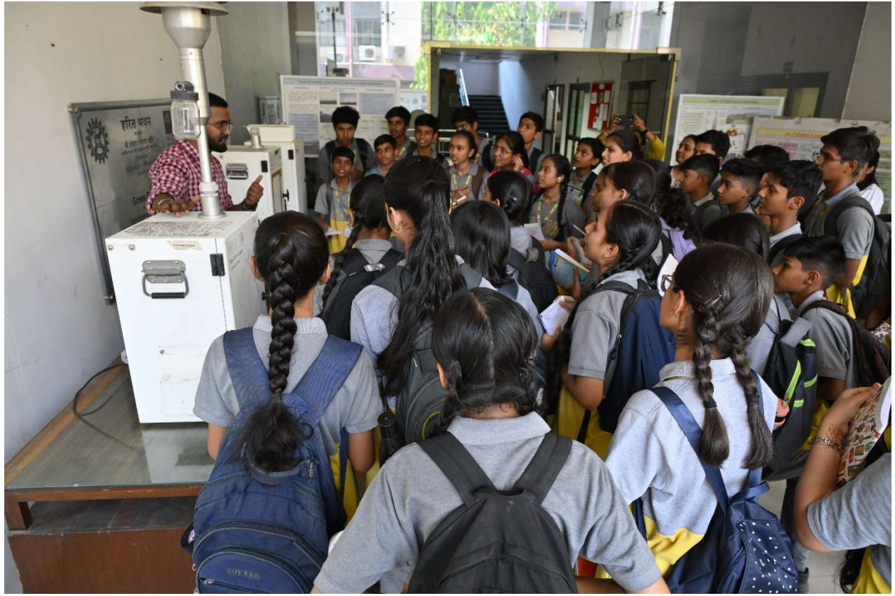
Students at a laboratory